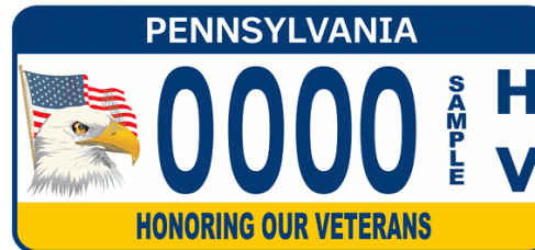
Honoring Our Veterans License Plates